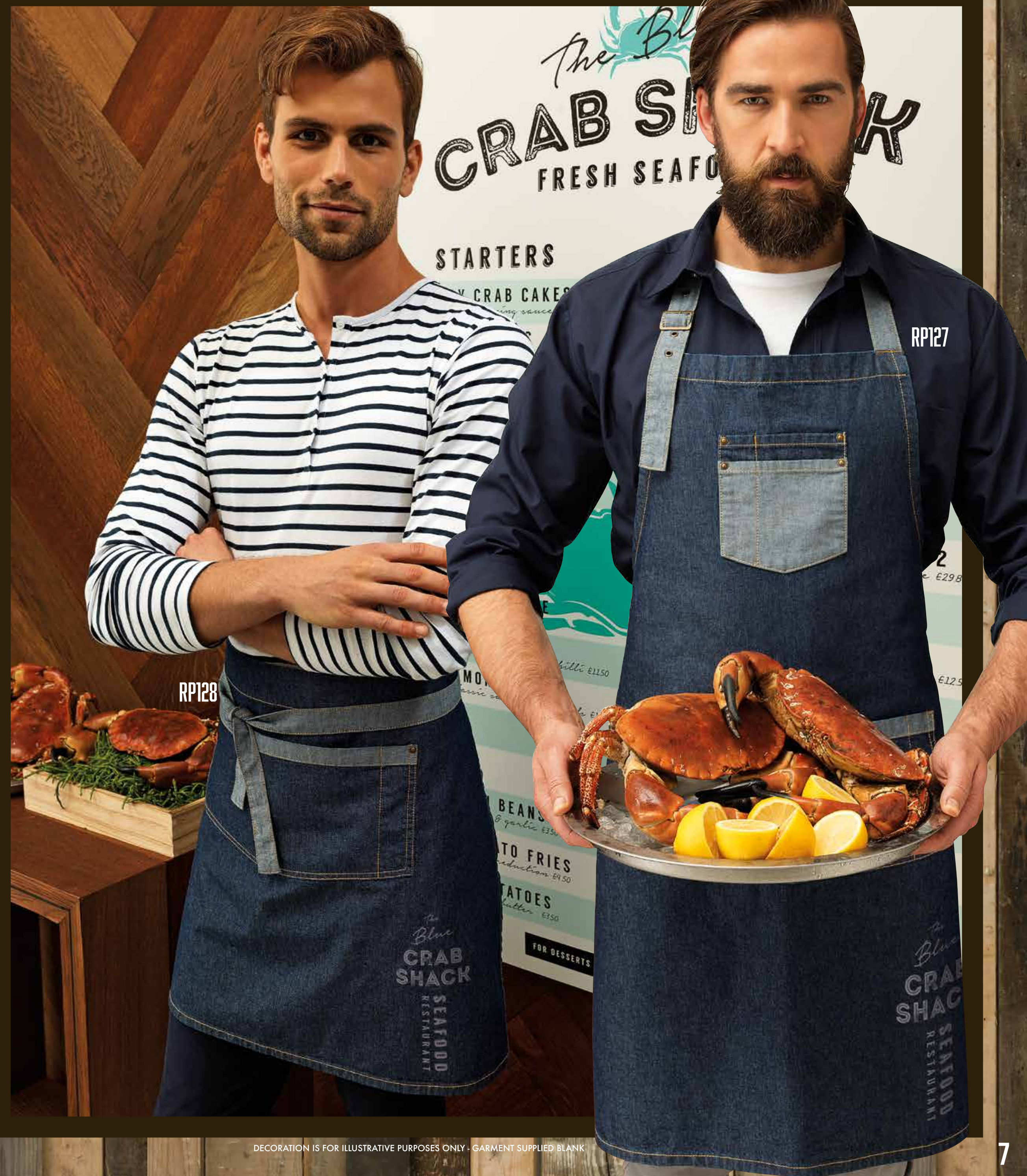
CONTRAST TIES WITH EYELET DETAIL

DECORATION IS FOR ILLUSTRATIVE PURPOSES ONLY - GARMENT SUPPLIED BLANK