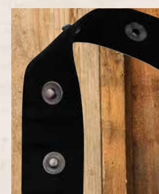
SNAP BUTTON FASTENING