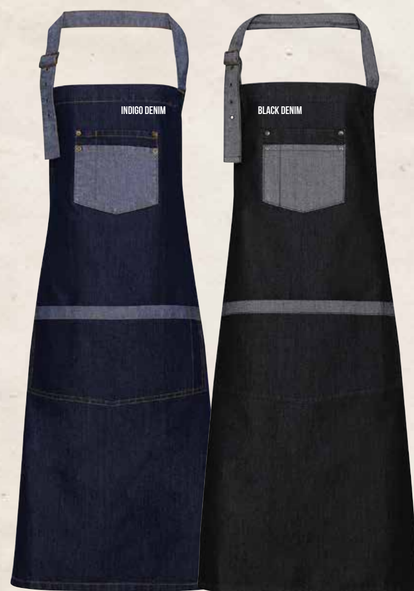
CONTRAST DENIM APRON