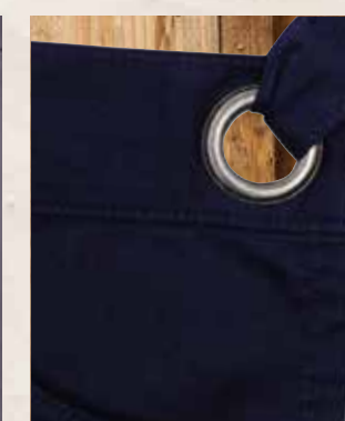
TIES WITH EYELET DETAIL