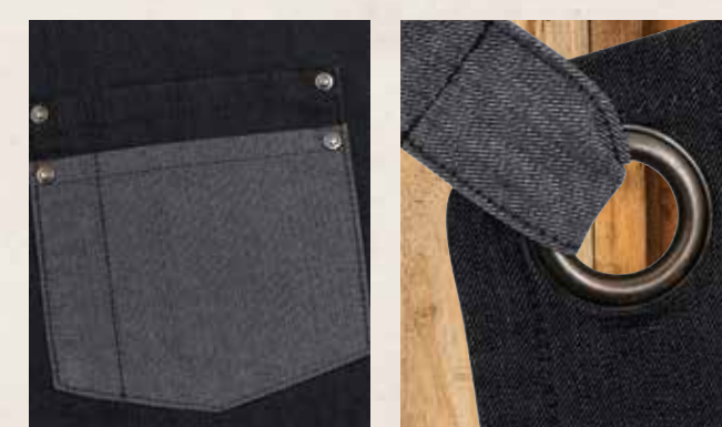
CONTRAST JEANS POCKET