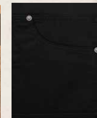
JEANS STYLE POCKET