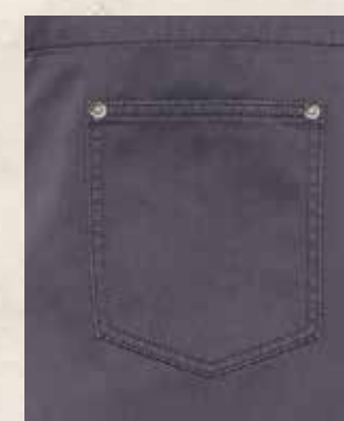
TOP CENTRE POCKET